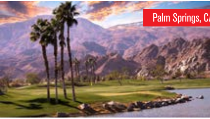
Palm Springs, CA